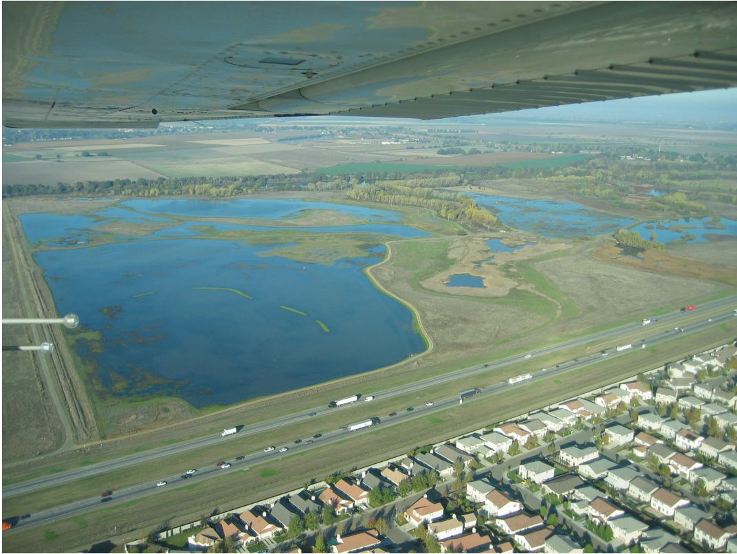
Stone Lakes National Wildlife Refuge was established in 1994; construction of the adjacent housing tracts began in 1999.

48,625 acres of cultivated lands; keeping them in wildlife-friendly crops. While not all of this acreage is within the core wintering area for cranes, it includes protection of 7,300 acres of high-value habitat (primarily corn or rice) for sandhill cranes. These conserved areas will be protected from future habitat loss due to development and incompatible crop conversions. Additionally, the plan prescribes creation of at least 595 acres of new crane roost sites. Some of these conservation sites will become part of Stone Lakes National Wildlife Refuge . The mitigation for construction disturbance and displacement of cranes includes providing unharvested food plots to supplement foraging habitat near the impact areas to attract cranes to a better food source. I also developed a strategy for no net loss of cranes from powerline strikes using a sophisticated model that allows estimation of annual mortality and mitigation by marking areas of existing lines to save at least as many cranes that new (temporary) lines may kill. The existing marked lines will continue to save cranes years after the temporary lines are removed. While crane habitat loss will continue in this region, the Bay Delta Plan will at least ensure that some key wintering areas are protected into the future.