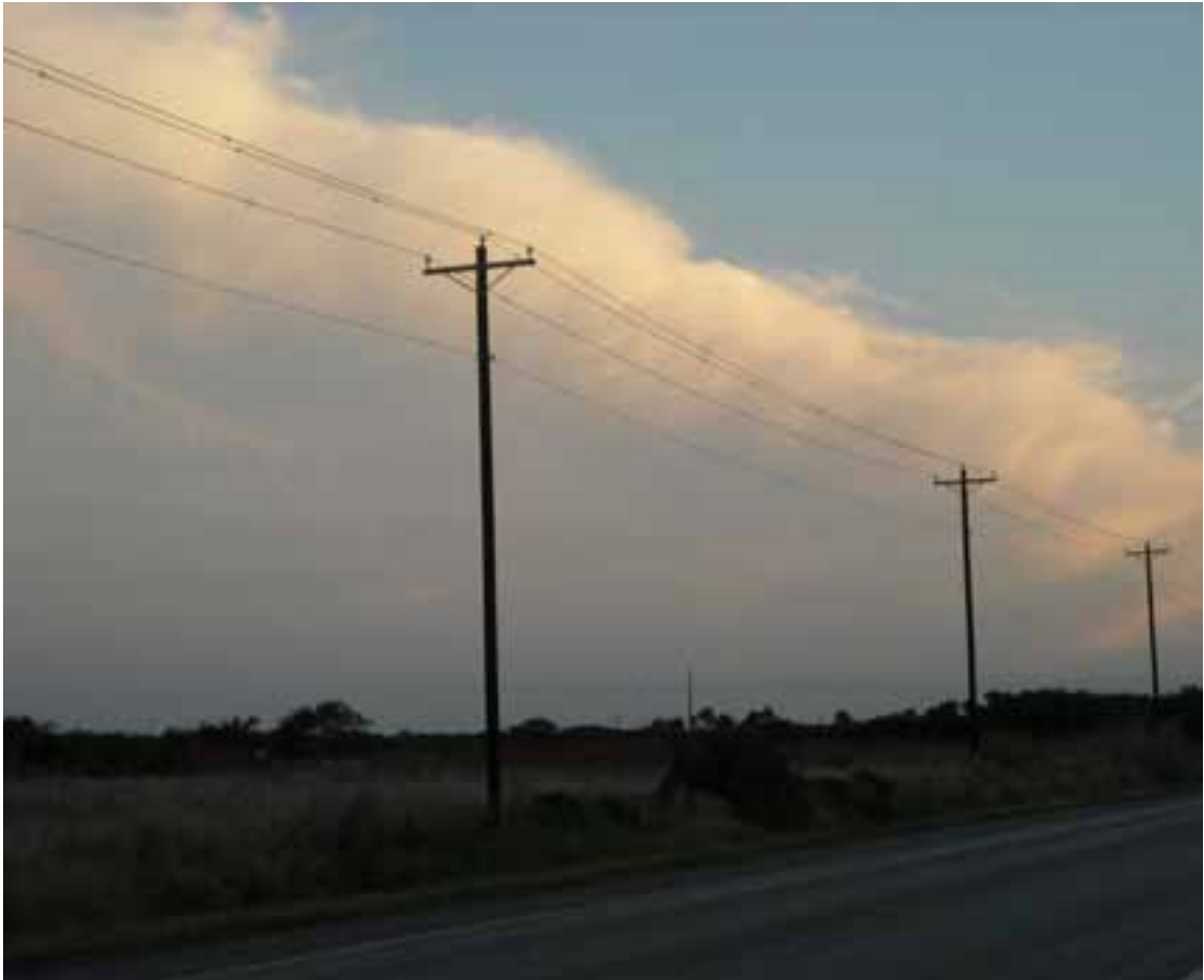
Power line marked by AEP with bird flight diverters on one side of highway by Lamar feeder. October 27, 2010.

Mr. Dan Parker. After twice observing the cranes low in flight coming in to that feeder, I had requested in March 2010 that the American Electric Power (AEP) utility mark the distribution lines on both sides of Highway 35 close to the feeder. This project was completed on one side of the highway by October, 2010.