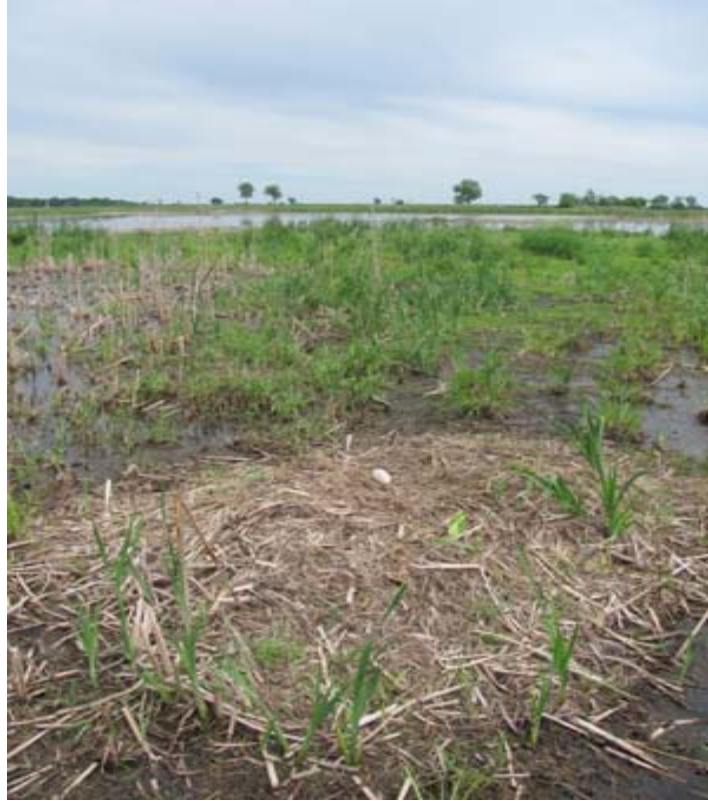
Wisconsin nests of a 2-year old female.

With the continued growth of the Eastern Migratory Whooping Crane Population, more cranes reaching breeding age, and wetlands on the Necedah National Wildlife Refuge (the original release location in western Wis.) being rapidly claimed by breeding pairs, Whooping Crane pairs have started spreading out into new nesting areas. This year there were five nests located off of the Necedah refuge. One of those nests was the nest of pair nos. 33-07 and 5-09. What makes this nest remarkable is that #5-09 is the first two year old female to lay an egg in the Eastern Migratory Population. Although many two year old females have built nest platforms with their mates, usually they must be at least three years old to produce an egg. Number 5-09 and her mate nested in Adams County, Wisconsin and incubated their single egg for 40 days (ten days over full-term) until we intervened and removed it from the nest. Examination of the egg at ICF indicated that it was infertile.