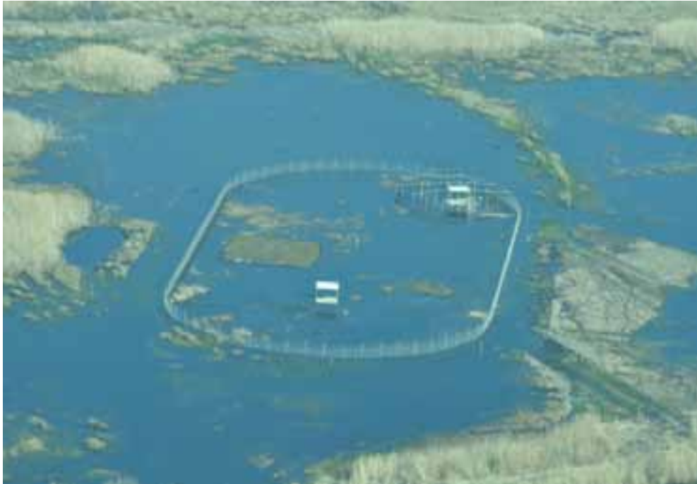
Aerial view of the crane pen pre-release at White Lake, Louisiana (King and Perkins 2011)

The federal 10j rule was passed in February, 2011 designating the nonmigratory whooping crane flock in Louisiana as experimental nonessential. This legal classification eases the regulatory tasks to manage the reintroduction. With the rule passed just in time, 10 birds were flown to Jennings and penned at White Lake on February 16 2011. It was an historic day since there has not been a non-migratory wild whooping crane in Louisiana since 1950. Congratulations to all that have worked so hard to make this happen. A large media event was held February 22 nd .