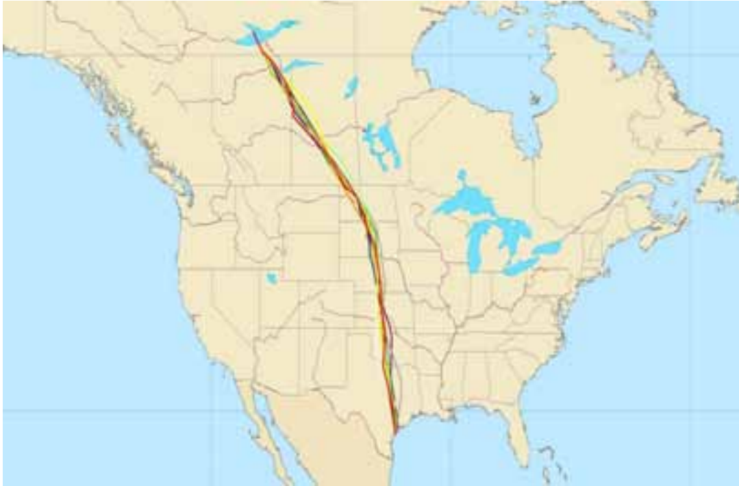
Migration tracks of 10 radioed whooping cranes in fall, 2010. Dr. Walter Wehtje. The Crane Trust.

The fall migration reporting season began August 18 th with 1 whooping crane in a flock of 50 sandhill cranes reported just southwest of Saskatoon. By September 9 th , five whooping cranes grouped as 1, 3 and 1 were known to be in Saskatchewan, including radioed subadult # 2009-01 ( RAY). By September 13 th , numbers had increased to 23 in Saskatchewan, with 18 of those together in a group at Muskiki Lake in SK (near Last Mountain Lake). Numbers built up to 37 at Muskiki Lake on September 29 th .