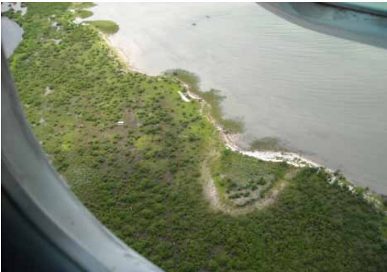
Dark green mangrove bushes filling in the salt marsh in the whooping crane winter range.

From an ecological standpoint, it may not be coincidental that the southern end of the crane range used to start just a few miles north of black mangrove. Hundreds of acres of occupied crane range have already been impacted. I believe the northward spread of mangrove is one of the most worrisome issues facing the cranes and estimate that > 33% of the winter crane range could become a monotypic stand of mangrove. Although its eventual distribution in the crane range may be limited by hydrological conditions, it currently is found over about one third the width of Matagorda Island from the outer bay edges inwards towards the interior marshes. The density of the mangrove seems to be increasing exponentially. No one has formulated any plans on what to do about this situation. Mangrove could theoretically be controlled with chemicals, but what a massive undertaking that may not be feasible. Also, mangrove has always been a plant favored by fisheries biologists, so permitting for mangrove control could be a difficult issue.