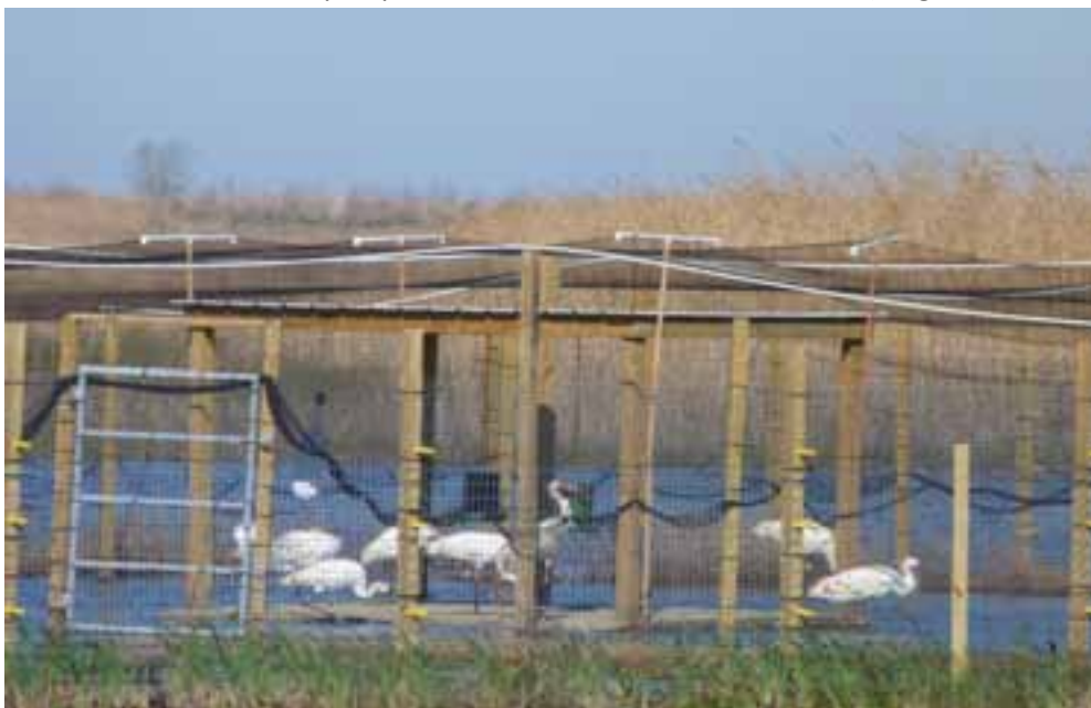
Conditions in the covered pen on 1 March 2011 (King and Perkins 2011).