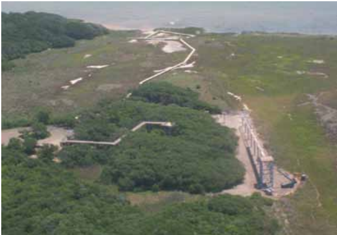
Tower construction built in front of old tower. April, 21, 2009.

The new tower was disassembled and stored on the old refuge airstrip in October 2010. Repairs were made to the old tower to prolong its usability through the 2010-11 season, after which it was torn down. A redesigned tower, constructed in summer 2011, will utilize the same footprint as the original tower with emphasis placed on it blending in with the natural environment.